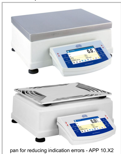
pan for reducing indication errors - APP 10.X2