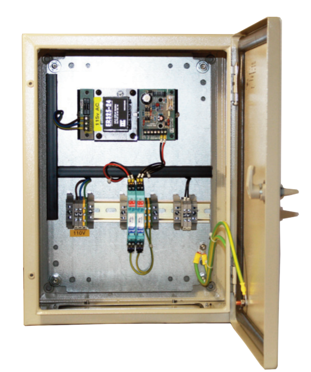
Optional EC91 Barrier and Power Supply Box

Oxygen analysers in hazardous area applications demand the best protection. Intrinsically safe instruments certified to 'ib' cannot be installed in Zone 0 areas, as the measurement gas must enter the analyser. ATEX certified 'ia' analysers, such as the EC91 can only be used in Zone 0 areas to provide adequate safety protection.