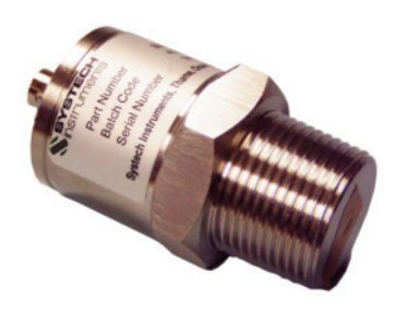
Optional EC91 Remote Mounted Sensor (All Stainless Steel)

The self-powered sensor has no moving parts and is integral to the sample chamber. This solves the problem of output changes due to a flow rate change, making the instrument extremely sensitive and quick to respond to changes in oxygen concentration.